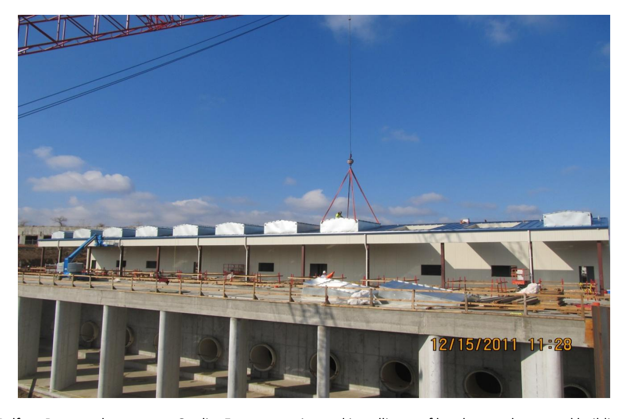
Balfour Beatty subcontractor Quality Erectors setting and installing roof hatches on the control building.