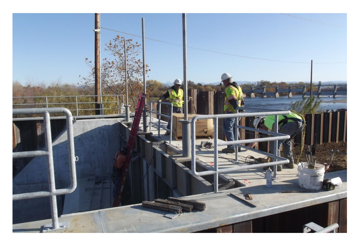
West Bay Builders subcontractor Blue Iron finishing installation of handrail at the Inlet Structure.