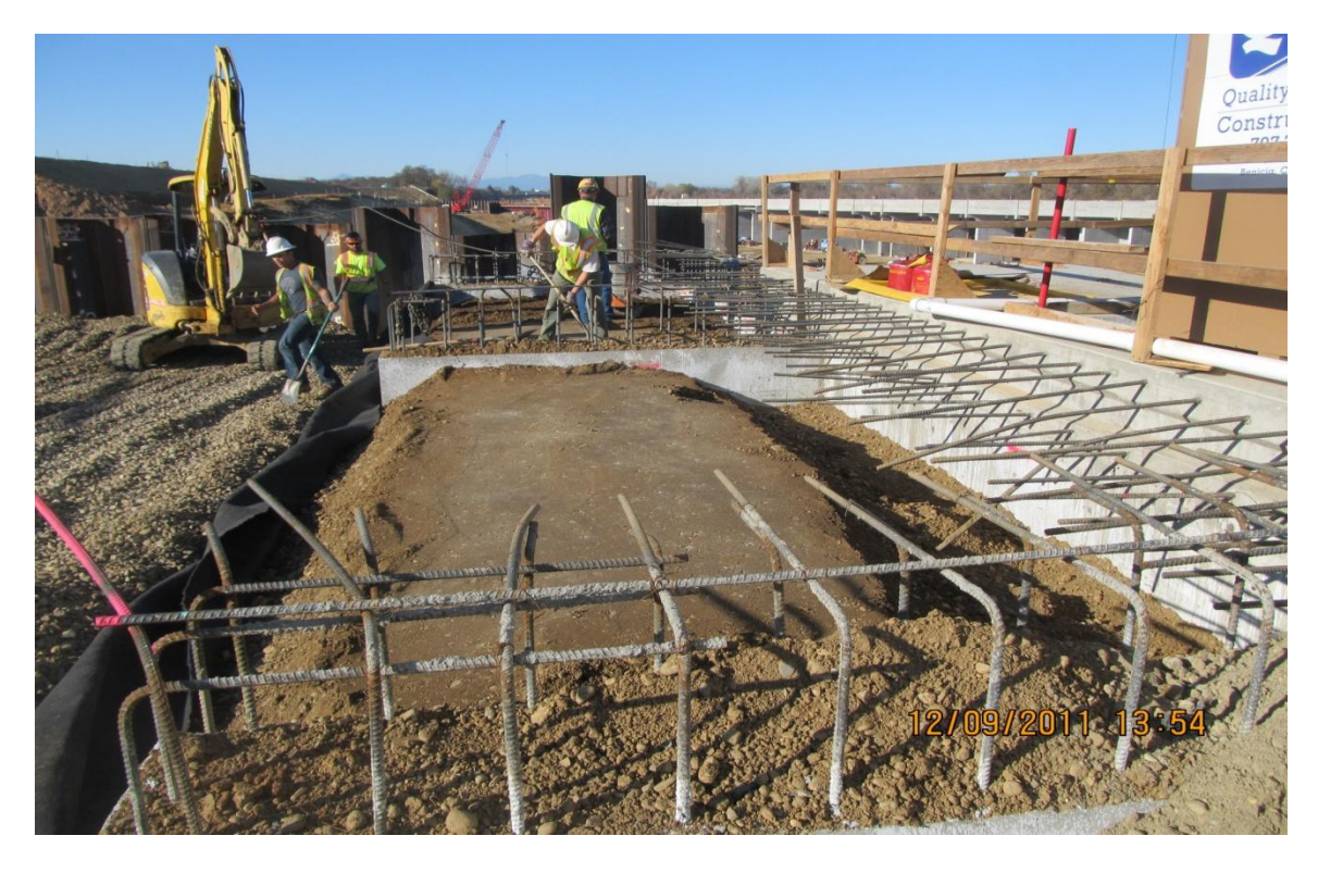
Balfour Beatty subcontractor Meyers backfilling at the Pumping Plant.