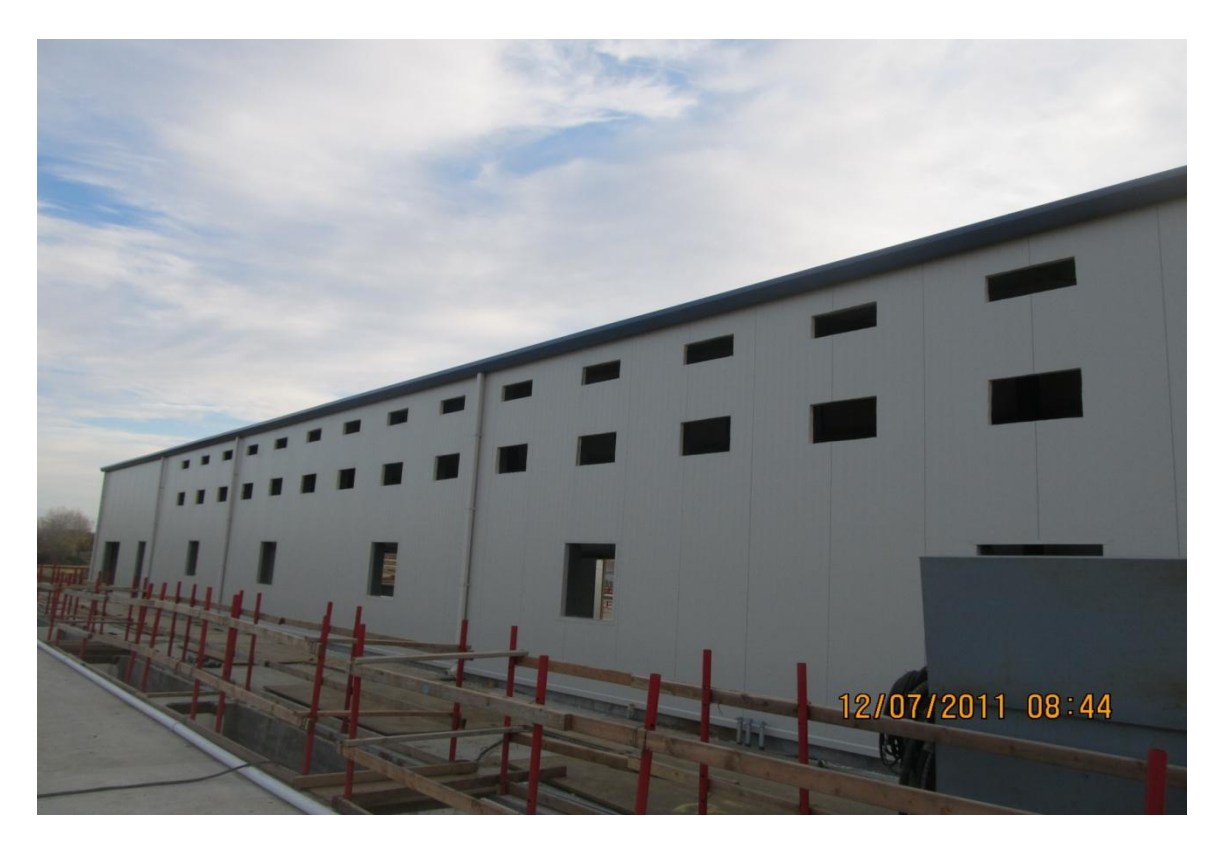
Balfour Beatty subcontractor Quality Erectors cutting out HVAC openings in the control building.