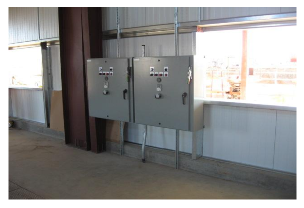
Balfour Beatty subcontractor Central Sierra Electric installed Fish Screen control panels.