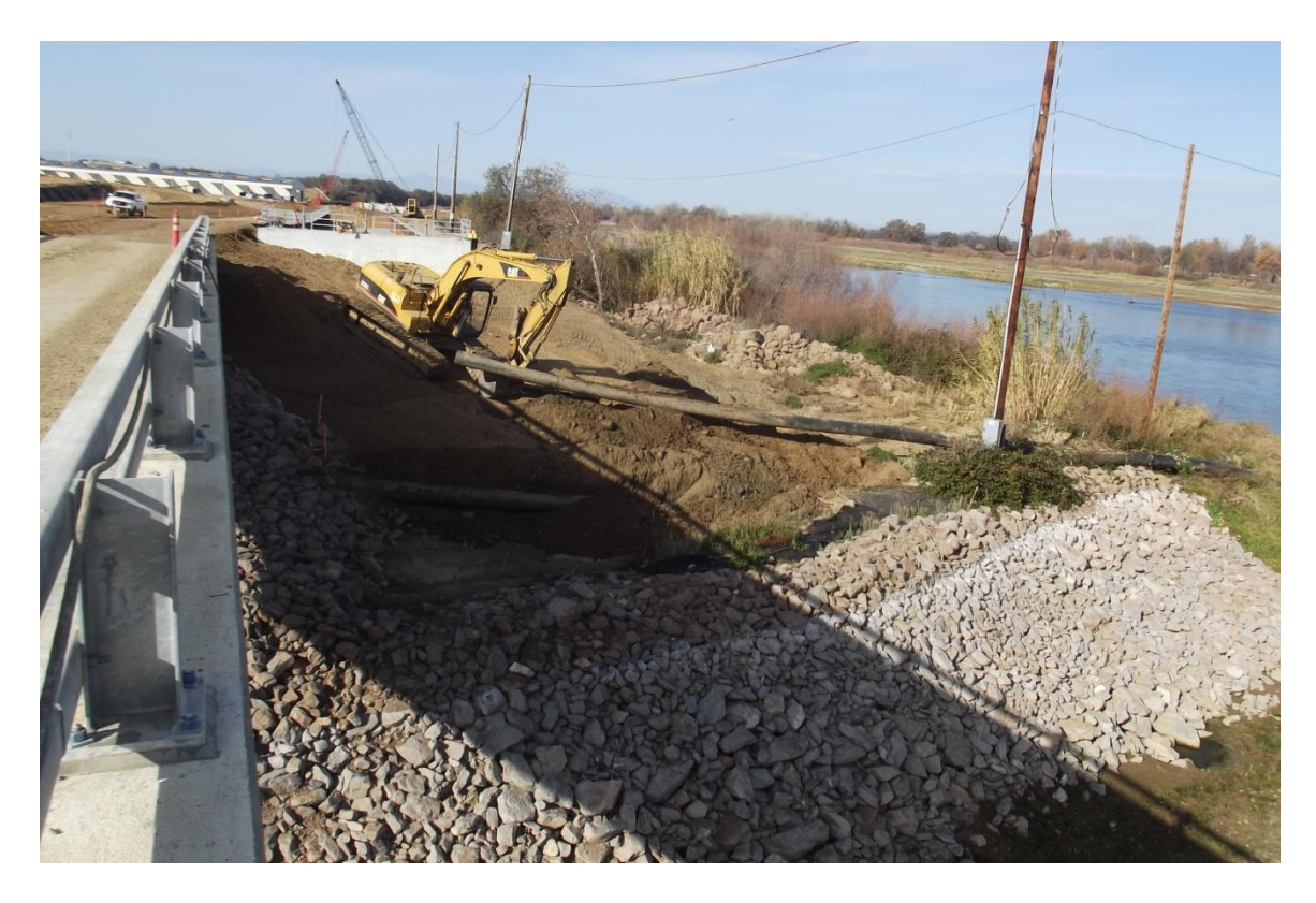
West Bay Builders subcontractor Meyers removing temporary pipeline.