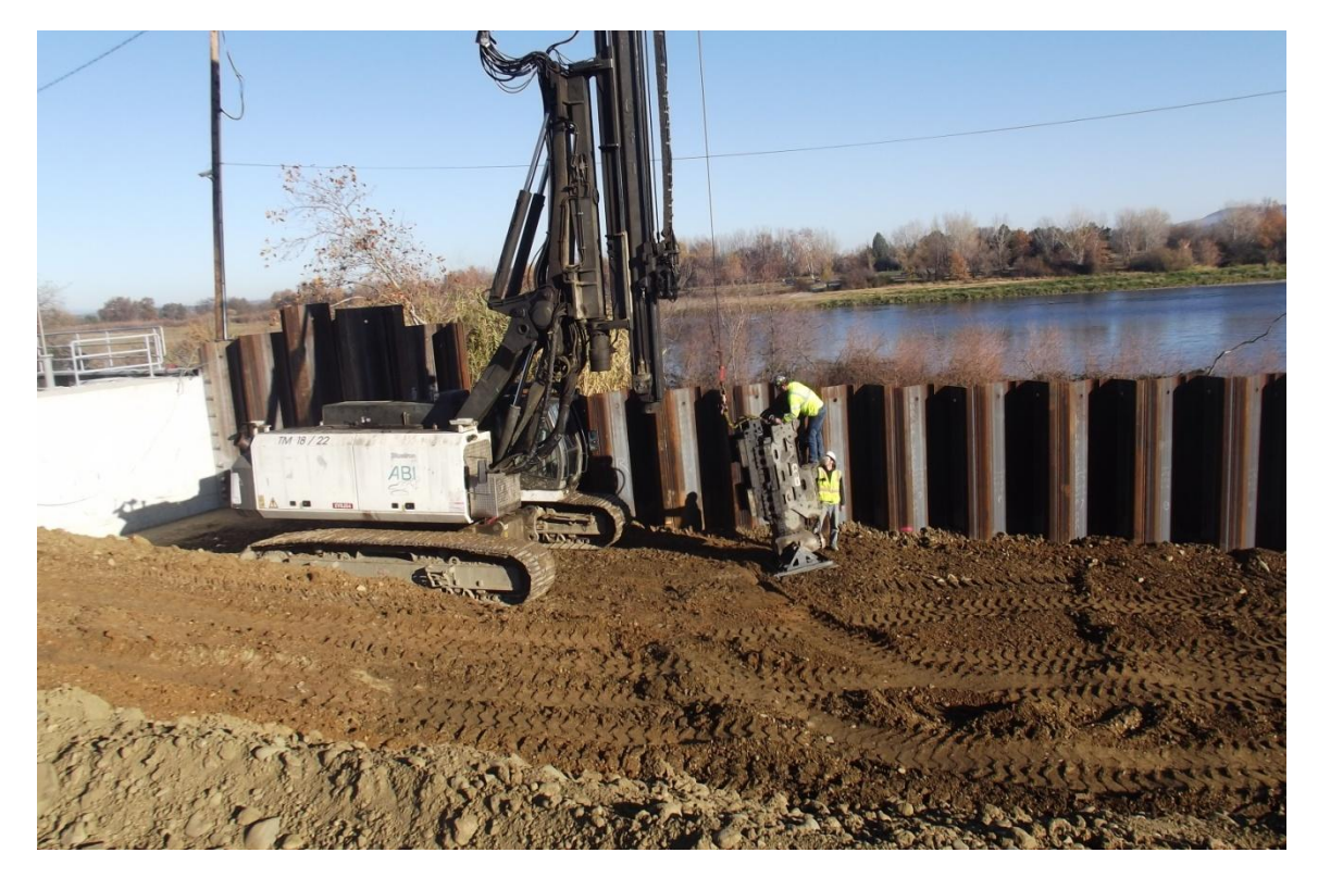
West Bay Builders subcontractor Blue Iron preparing ABI machine to remove temporary sheet pile.